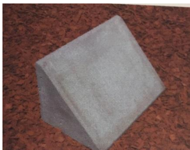
Concrete Sloper Included in plot price

It was agreed onsite that the cost of the plot includes the cost of the standard concrete sloper/headstone. The only other option available will be a granite sloper instead and this cost will be additional to the plot price. It must be noted that this price does not include the cost of the plaque, which can be bought from either Logan City Council or privately sourced.